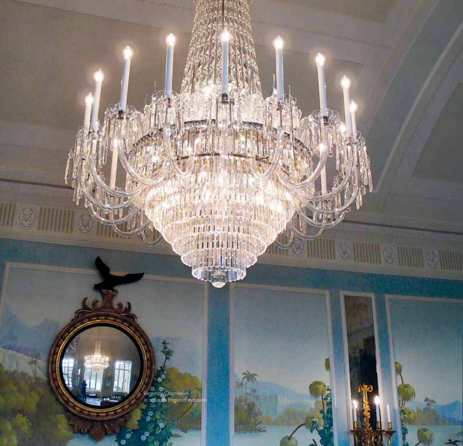
Regency Chandelier in a South England mansion