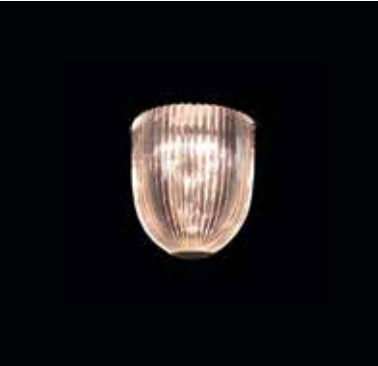
Art Deco Wall sconce 42358-W-1 Lobjmeyr, 2005

W.: 15 cm, H.: 16 cm P.: 8 cm; Wt.: 2 kg 1 light; max. W.: 60 Brass, hand cut crystal; Nickel finish