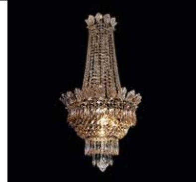
Regency Pendant 42687-9 Historical, ca. 1815

Dia.: 65 cm, H.: 65 cm Wt.: 9 kg 6 lights; max. W.: 360 Brass, lead-free glass; Nickel finish