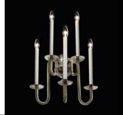
Schloss Hof Wall sconce 4636-W-2 Historical, ca. 1720

Dia.: 80 cm, H.: 73 cm Wt.: 10 kg 8 lights; max. W.: 480 Brass, lead-free crystal; Nickel finish