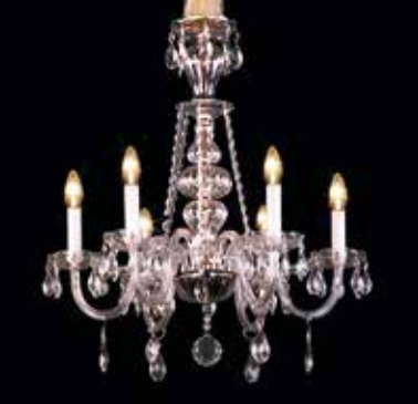
New George Chandelier 42146-6 Historical, ca. 1840

Dia.: 65 cm, H.: 65 cm Wt.: 9 kg 6 lights; max. W.: 360 Brass, lead-free glass; Nickel finish