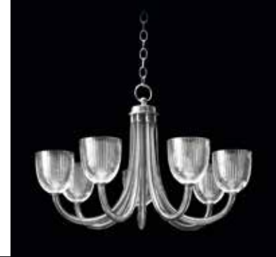
Prutscher Chandelier 4257-7 Otto Prutscher, 1934

W.: 15 cm, H.: 16 cm P.: 8 cm; Wt.: 2 kg 1 light; max. W.: 60 Brass, hand cut crystal; Nickel finish