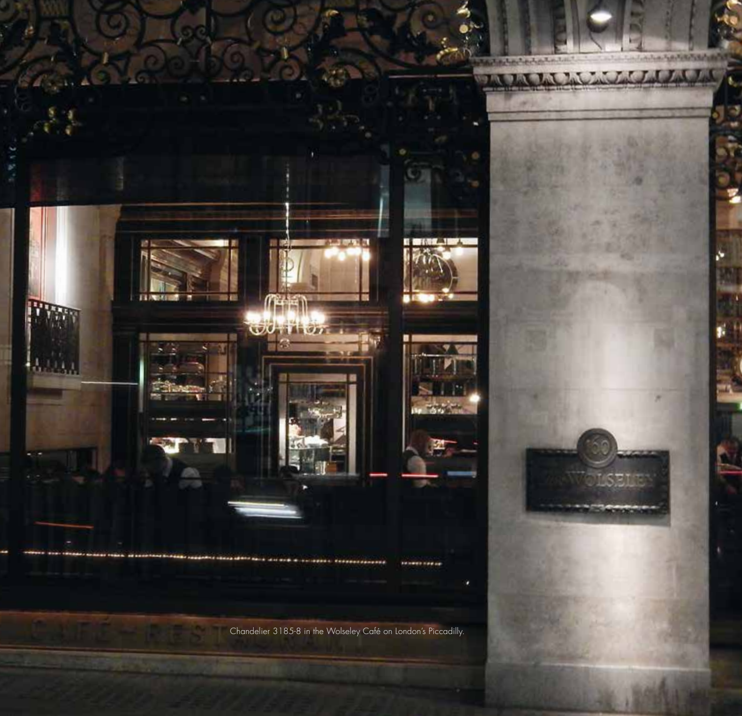
Chandelier 3185-8 in the Wolseley Café on London's Piccadilly.