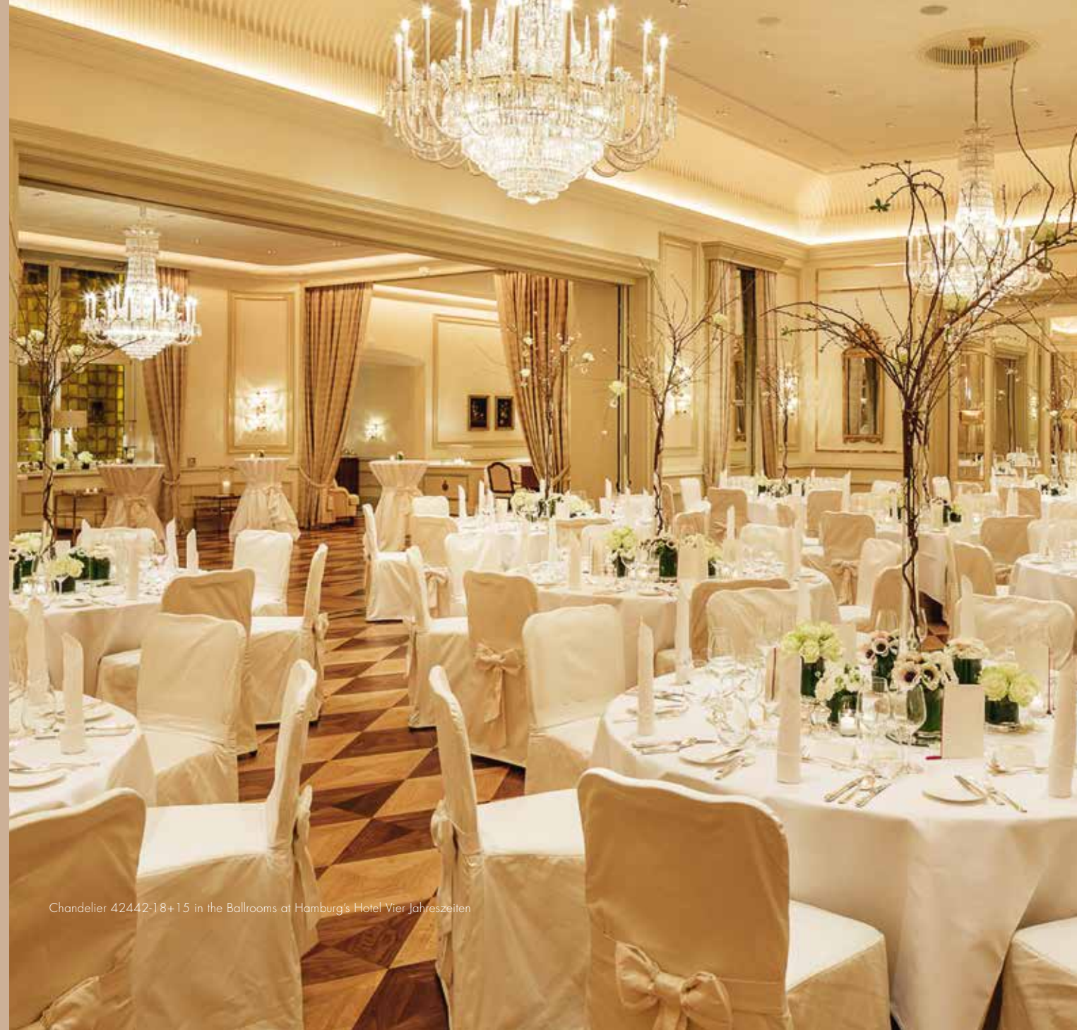
Chandelier 42442-18+15 in the Ballrooms at Hamburg's Hotel Vier Jahreszeiten