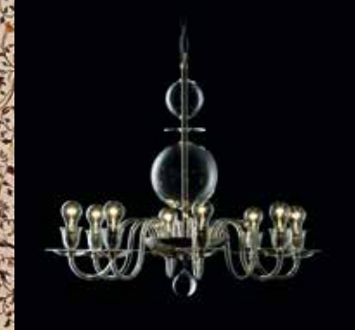
Musseline Chandelier 42426-8 Hans Harald Rath, 1925

W.: 50 cm, H.: 70 cm P.: 29 cm; Wt.: 9 kg 5 lights; max. W.: 300 Brass, lead-free crystal; Nickel finish